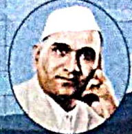
Karmaveer Bhausaheb Hiray